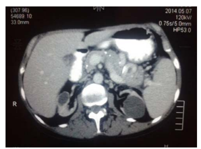
Fig. 2 – Abdominal multislice computed tomography (MSCT) scan verified the enlargement of the entire pancreas, as well as the presence of heterogeneous structures with diffuse amorphous calcifications.

Parathyroidectomy was indicated. However, soon after the ongoing AP episode was taken care of, a new AP episode occurred during the preparations for the parathyroid surgery. A repeated abdominal MSCT scan verified the enlargement of the entire pancreas, as well as the presence of heterogeneous structures with diffuse amorphous calcifications. The pancreatic duct was dilated in the tail of pancreas. There was a smaller amount of peripancreatic free fluid collections. Enlarged lymph nodes could be seen in retroperitoneum, some up to 10 mm. Also, during this examination, lytic lesions in the pelvic bones could be seen on both sides (Figure 2).